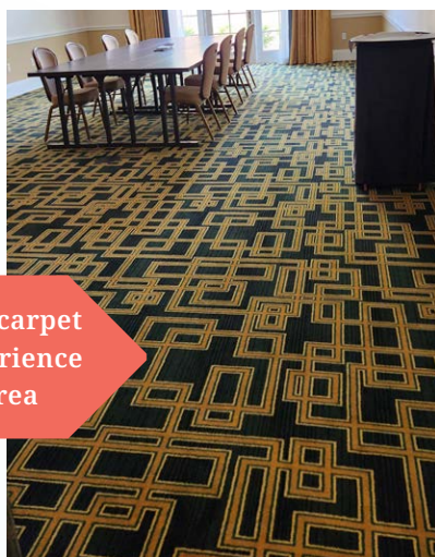
Example of carpet within Experience Center area

The ISPA Experience Centers will be located on Level 1 meeting rooms in Bartolin Hall. The rooms are adjacent to the Expo Floor. Each room has a slightly different square footage so be sure to confirm the room size with ISPA by contacting Jessica Roberts or by viewing the room diagram on page 2.