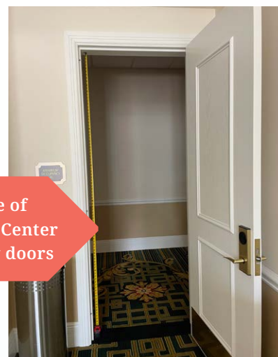
Example of Experience Center room entry doors