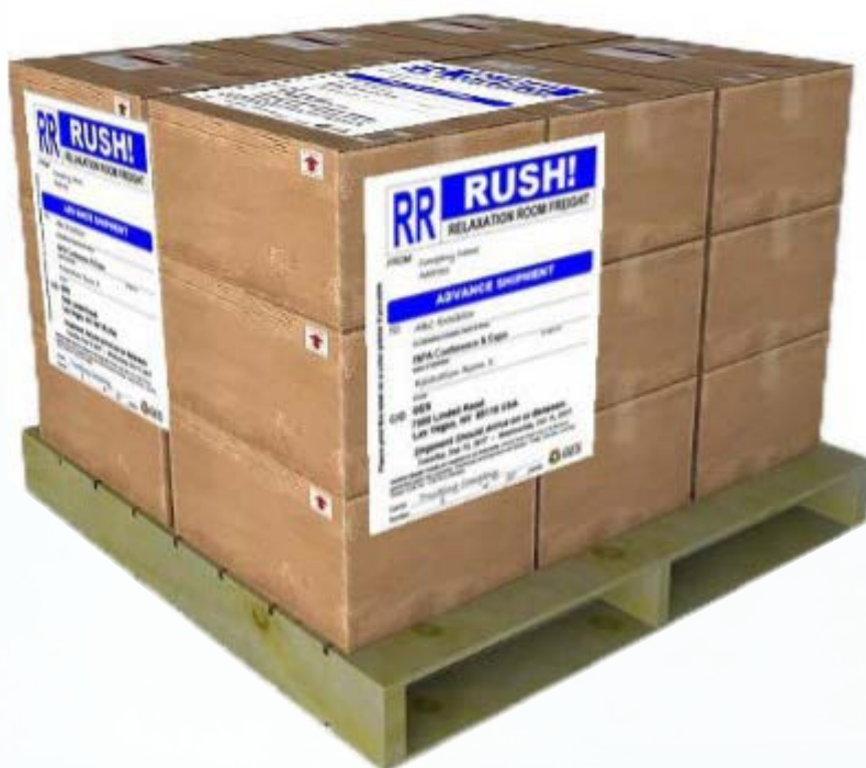
Example of properly labeled pallet

ISPA will provide you with the proper shipping labels for Experience Center Freight in early February.