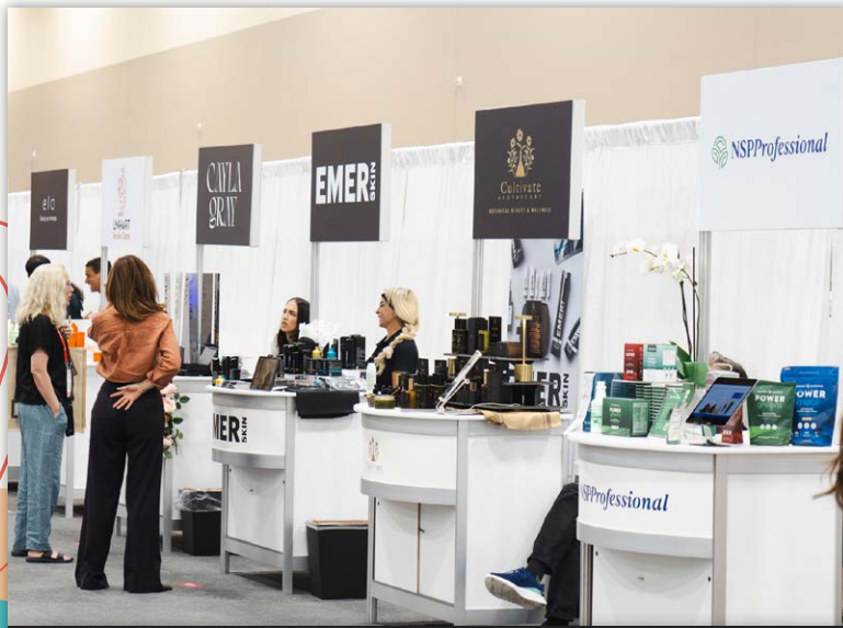
Example of Emerging Brand Kiosks with branding applied